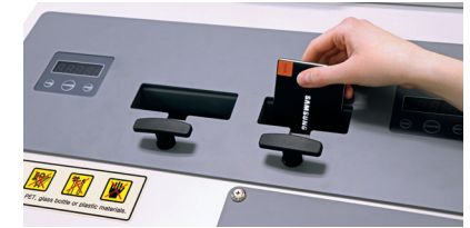
Fig. 2b Laptop drive infeed