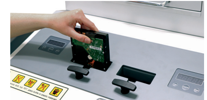
Fig. 2a Desktop drive infeed