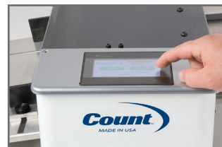
Touch Screen Controller

The COUNT™ iCrease Pro + is a robust solution for creasing and perforating digital media to eliminate cracking when folding. Get the automation of bigger COUNT machines in a simple hand-feed machine anyone can use. The iCrease Pro + can crease and perf in one pass (no need to refeed!), with multiple crease locations and perfect bind covers, with choice of automatic hinge placement or no hinge.