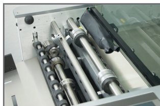
CAM Actuated Compression Creasing

Combines creasing and perforating in one simple yet powerful machine.