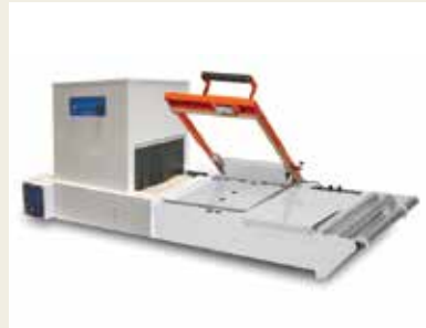
Clamco Combo Junior shrink wrap system