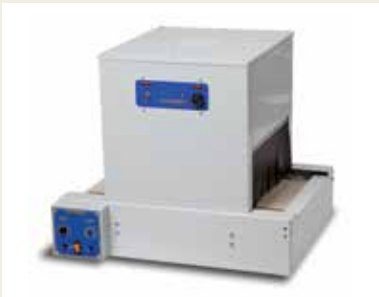
Clamco 820 shrink tunnel

Our family of Clamco tabletop sealers and shrink tunnels are the perfect solution for dependable, long-life performance. Designed for smaller production demands, these products are constructed of heavy-gauge materials and combine advanced engineering with rugged, time-proven features. Each is expertly crafted by Clamco, the industry's respected name for reliability and value.