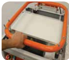
Ergonomic by design, the tubular seal arm delivers dependable, long-term service.