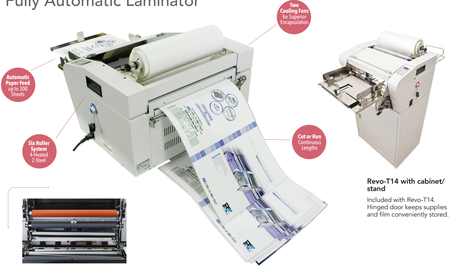
Revo-T14 with cabinet/stand Included with Revo-T14. Hinged door keeps supplies and film conveniently stored.